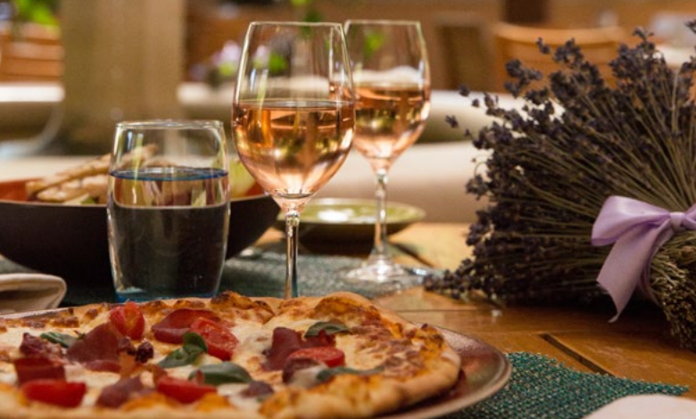
Le Tousco located adjacent to the infinity pool