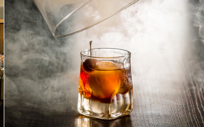
Le Gaudina restaurant and lounge bar