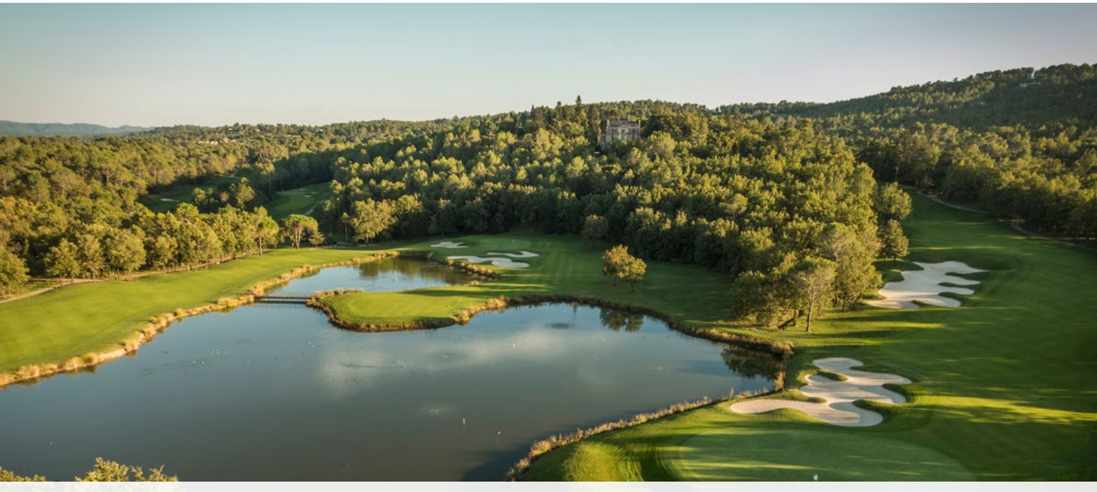
LE CHATEAU COURSE