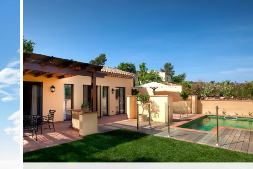
MÉDITERRANÉE VILLA 100 square metres with a private pool