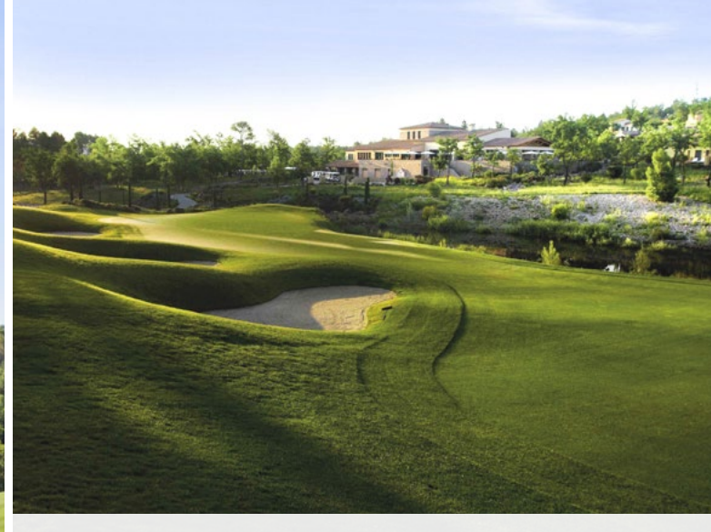
LE RIOU COURSE AND THE CLUBHOUSE