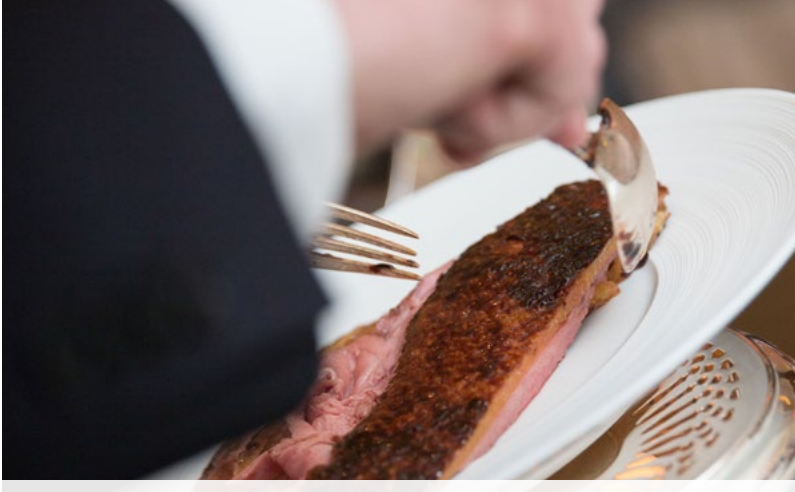
Le Faventia, contemporary French gastronomy restaurant