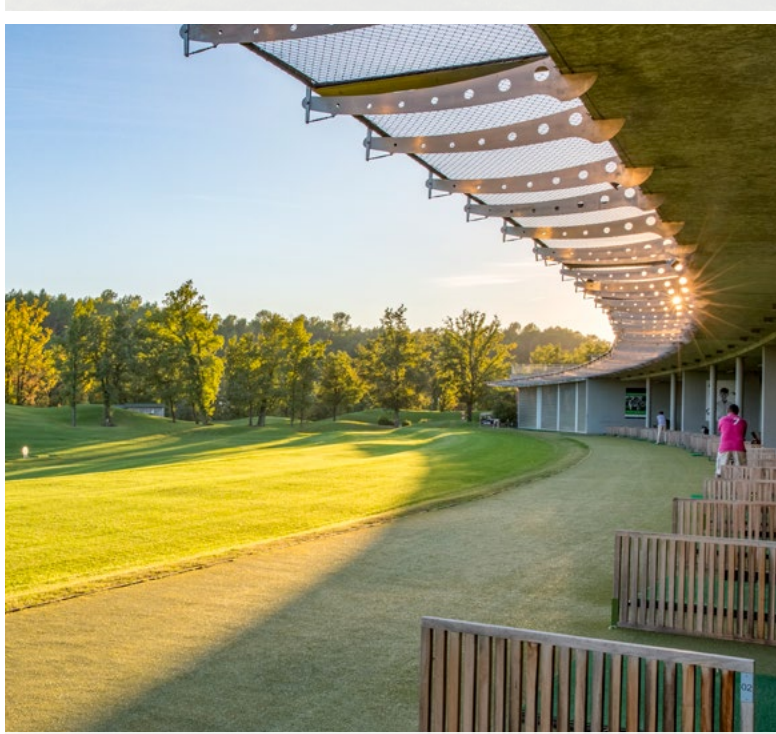
THE ALBATROS GOLF PERFORMANCE CENTER